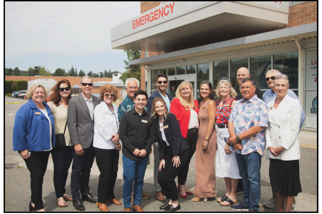
Pictured: IHF Board Members and Staff

Building a healthier community. Together.