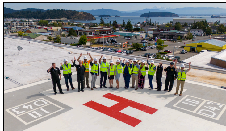
Island Health, Senator Maria Cantwell and the Island Health Foundation celebrate the new rooftop helipad.

Thanks to the generous support of donors including individuals, foundations and businesses, the Island Health Foundation contributed $1.5M to the project. Additional funding for this project was made possible through a congressionally-directed spending award supported by Senator Maria Cantwell.