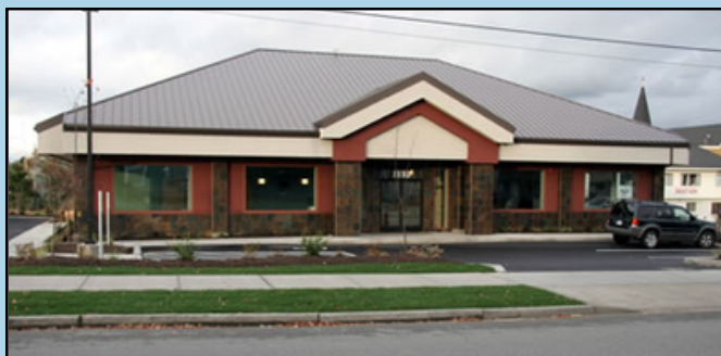
22nd Street "Barto Building" Island Pulmonology and Island Urology