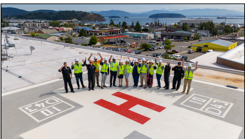
Island Health, Senator Maria Cantwell and the Island Health Foundation celebrate the new rooftop helipad.

Thanks to the generous support of donors including individuals, foundations and businesses, the Island Health Foundation contributed $1.5M to the project. Additional funding for this project was made possible through a congressionally-directed spending award supported by Senator Maria Cantwell .