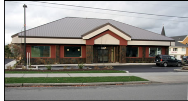
22nd Street “Barto Building” Island Pulmonology and Island Urology