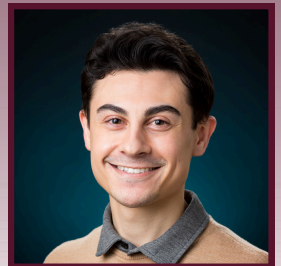
Josh Johnson Foundation Operations Coordinator