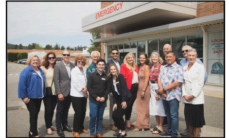
Pictured: IHF Board Members and Staff

Building a healthier community. Together.