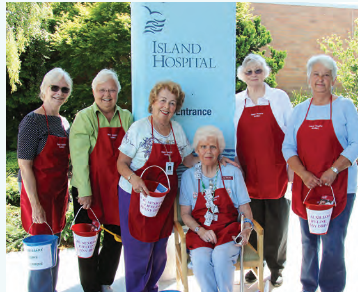
Island Hospital Auxiliary